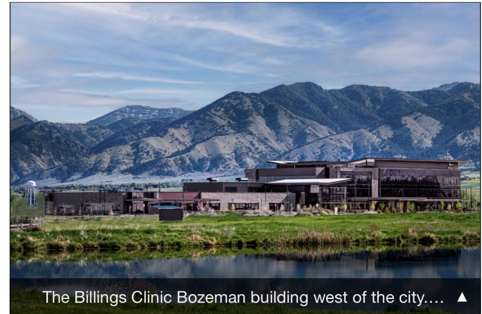
The Billings Clinic Bozeman building west of the city... ▲

Bozeman Health, Billings Clinic joining forces on west Bozeman campus