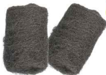
2 x Non-Scratch Fine Steel Wool (for older glass only)