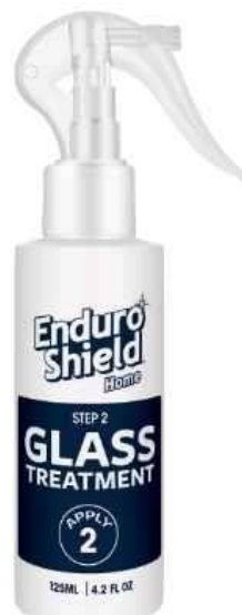
125ml EnduroShield Glass Treatment