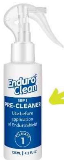
125ml EnduroClean Pre-Cleaner