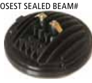
Back View – 735434 / 735435