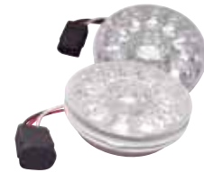
735403 / 735404