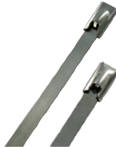
150LB Stainless Steel Cable Ties