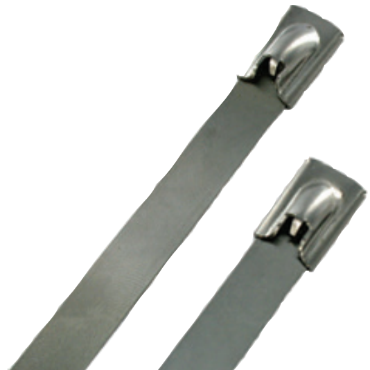
250LB Stainless Steel Cable Ties