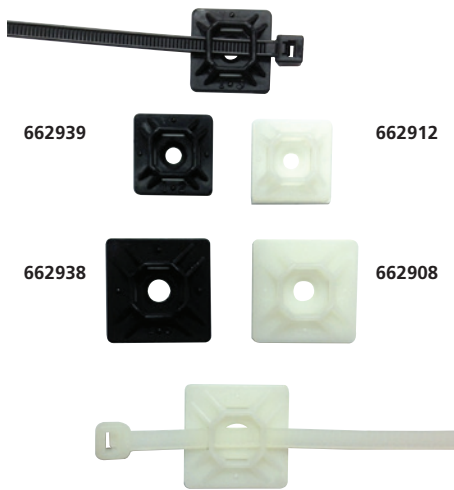
Adhesive Backed Mounting Pads