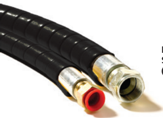
Heavy-Duty Spiral Wrap (Applications)