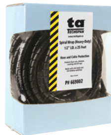
Heavy-Duty Spiral Wrap (Packaging)