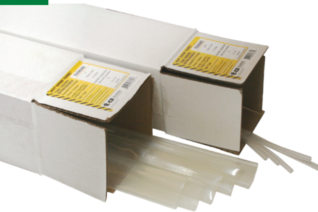
Dual Wall (Adhesive-Lined) Heat Shrink Tubing – 4FT Lengths