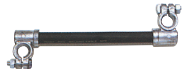
Heavy-Duty Jumper Cables with Elbow Terminals (Offset)