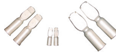
Fast 'N' Safe Battery Connector Contacts

Recognized under the component program of Underwriters Laboratories, Inc.