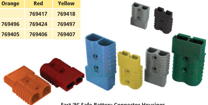
Fast 'N' Safe Battery Connector Housings