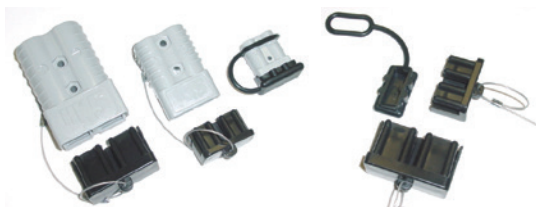
Fast 'N' Safe Battery Connector Protective Covers