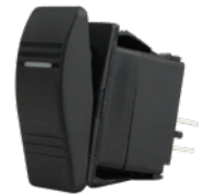
S.P.S.T Front View