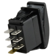
D.P.D.T Back Angle View