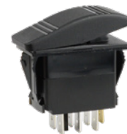
D.P.D.T Angle View