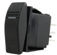
D.P.D.T Front View