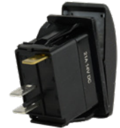
S.P.S.T Back Angle View