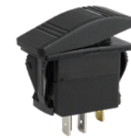
S.P.S.T Angle View

Now made with a clear lens. Diodes will light up to the colour specified in the description