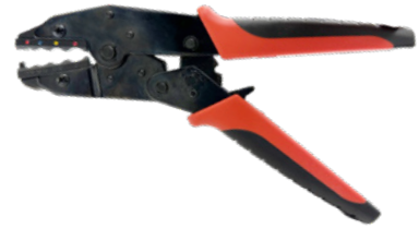
*761810 Ratchet Crimp Tool for Heat Shrinkable Terminals & Connectors

*761810 High quality ergonomic ratchet crimp tool that is especially built for crimpable heat shrink terminals contains an alignment guide to ensure dies do not slip while crimping. 4 nested dies allow crimping of wire sizes 22-18GA, 16-14GA, 12-10GA and 8GA and will ensure a uniform crimp. Approximate length: 8.86" (225mm)