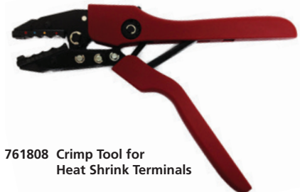
761808 Crimp Tool for Heat Shrink Terminals

761808 High quality ergonomic ratchet crimp tool that is especially built for crimpable heat shrink terminals contains an alignment guide to ensure dies do not slip while crimping. Tool also contains a built-in release switch in case terminal or wire isn't inserted properly. 4 nested dies allow crimping of wire sizes 22-18GA, 16-14GA, 12-10GA and 8GA and will ensure a uniform crimp. Length: 10-3/4" (273.05mm)