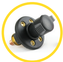
4 Mounting Holes