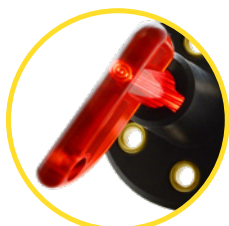
765214 Red LED Indicator on Actuator