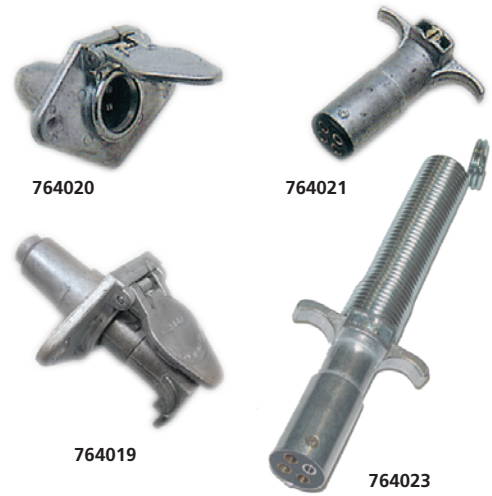
Heavy-Duty 4-Pole Connector

*NEW *764222 Helps eliminate poor electrical connections due to corroded trailer terminals. For Plugs & Sockets