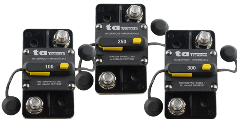
High Amperage Circuit Breakers/Manual Reset/Surface Mount