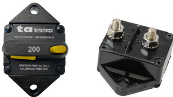
High Amperage Circuit Breakers/Manual Reset/Panel Mount