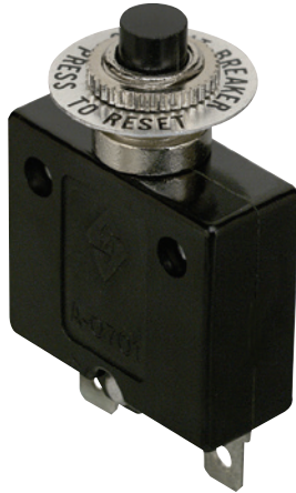
Thermal Circuit Breakers