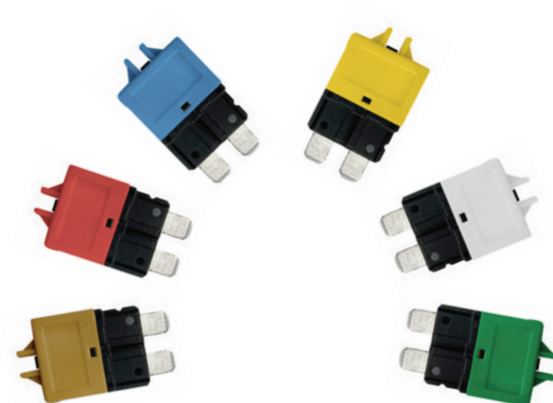
Manual Reset 'Standard' Blade Fuse-Type Circuit Breakers