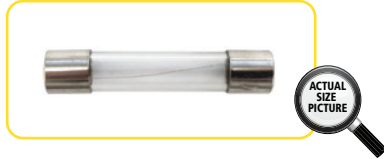
Glass Fuses – Type AGC