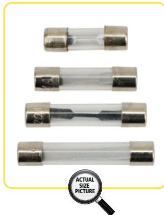
Glass Fuses – Type SFE