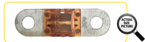
Bolt-On, 'Mid'-Amperage Fuses