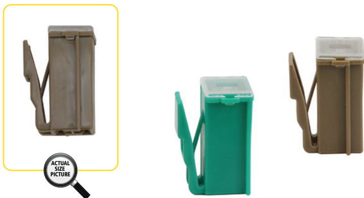
PAL – Female Terminations (with Locking Tab) Auto Link Fuses