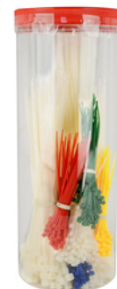
562999 Cable Tie Assortment – Coloured Ties/Jars