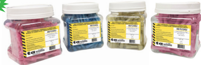
Crimp 'N' Shrink Butt Connectors (Automotive Series) in Jar Assortments