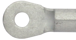
Stud Size: 5/16" 762462 25 pk 762462C 100 pk