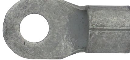
Stud Size: 1/2" 762480 25 pk 762480C 100 pk