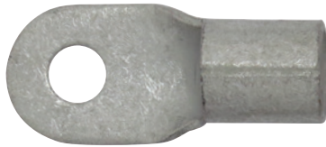
Stud Size: 5/16" 762466 25 pk 762466C 100 pk