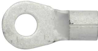
Stud Size: 3/8" 762463 25 pk 762463C 100 pk