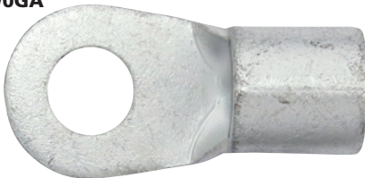
Stud Size: 3/8" 762479 25 pk 762479C 100 pk