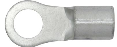
Stud Size: 1/2" 762468 25 pk 762468C 100 pk