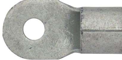
Stud Size: 1/2" 762476 25 pk 762476C 100 pk