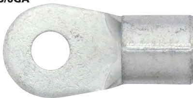
Stud Size: 3/8" 762475 25 pk 762475C 100 pk