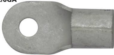
Stud Size: 5/16" 762470 25 pk 762470C 100 pk