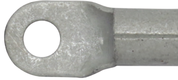
Stud Size: 3/8" 762467 25 pk 762467C 100 pk