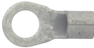
Stud Size: 1/2" 762464 25 pk 762464C 100 pk