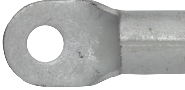
Stud Size: 3/8" 762471 25 pk 762471C 100 pk