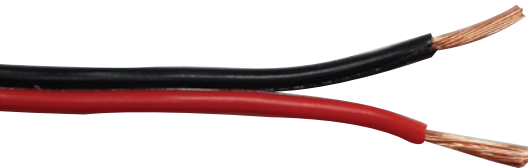
Type GPT-2 Conductor - Parallel Bonded

Parallel bonded Black and Red conductors are PVC insulated