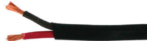
2 Conductor, Black Jacketed Flat Cable