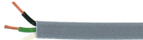
3 Conductor, Grey Jacketed Flat Cable