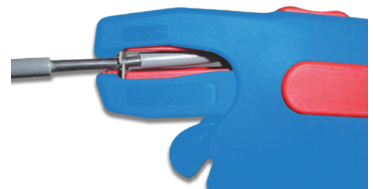
669963 Stripper for Flat & Round Type Wire/Cable

Part number 669963 can now be found on page 95