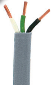
3 Conductor, Grey Jacketed Flat Cable