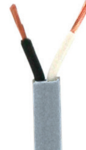
2 Conductor, Grey Jacketed Flat Cable