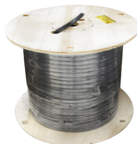
Flat Multi-Conductor Cable in 1000' (305m) Spools