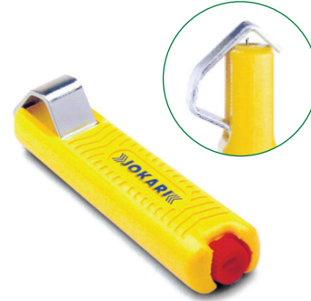
Heavy-Duty Wire Stripper 10270 Made of extremely wear-resistant nylon. Adjustable cutting depth, automatic settings. Spare blade included. Strips #1 to 750 MCM.