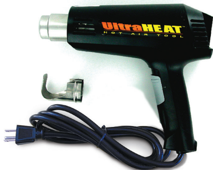
2 Stage Heat Shrink Gun HS-GUN 750 degrees F. and 1000 degrees F., 120V, 1200 watts, 4100 BTU. Includes hot air baffle.