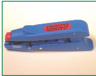
Ergonomic Wire Stripper/Cutter Plier 669968 Ergonomic wire stripping tool. Good for 22 - 10 AWG.