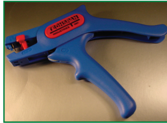
Ergonomic Wire Stripper/Cutter Plier 669970 Ergonomic wire cutting and stripping tool, trigger style design comes with wire stopper. Good for 22 - 10 AWG.