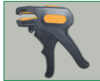
Flat & Round Type Wire/Cable Stripper 669963 This tool strips flat PVC jacketed multi conductor cables and parallel jacketed (ribbon) cable. Strips stranded wire from 20-6 ga.