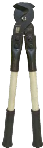
MXC-2100F 21" LONG ARM MANUAL CUTTER