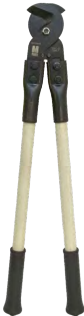
MXC-2600F 26" LONG ARM MANUAL CUTTER