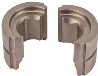
Equivalent to Alcoa 60 Ton Dies