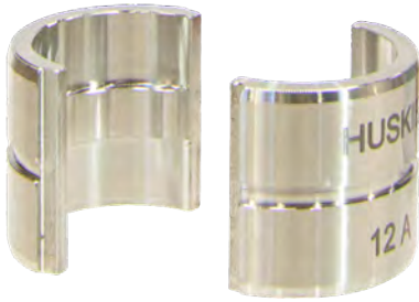
12 Ton U-Style Compression Dies