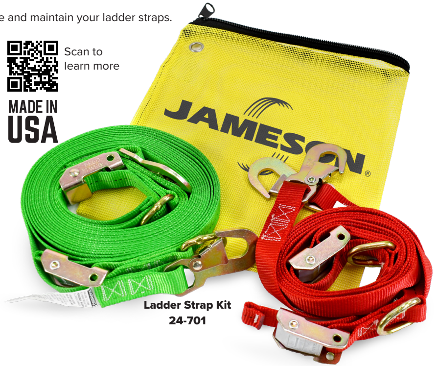
Ladder Strap Kit 24-701