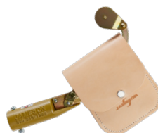
32-18 Pruner Blade Guard

Pruner Bumpy Rope, Red, White & Blue with Handle 5/16" X 20'