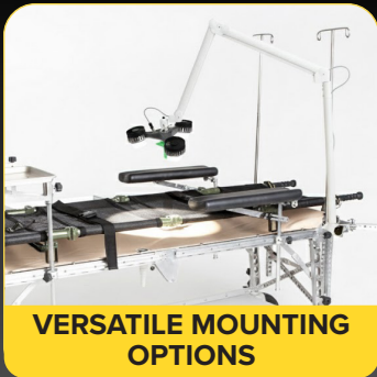
VERSATILE MOUNTING OPTIONS