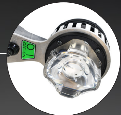
TRI SPOKE DESIGN 3-Pods Eliminate Shadows