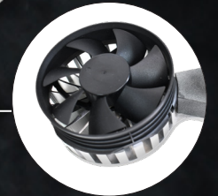
ENERGY EFFICIENT DESIGN Uses less power and stays cooler than halogen