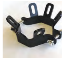
Ring Clip Collar Included With Auger-Up