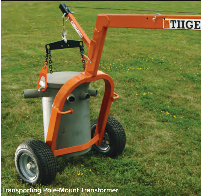
Transporting Pole-Mount Transformer