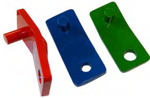
Available Sizes: 1/2", 5/8" & 3/4" Rod Diameter

For use with rotary hammer and driver socket The use of impact tools or jack hammers may shorten service life.