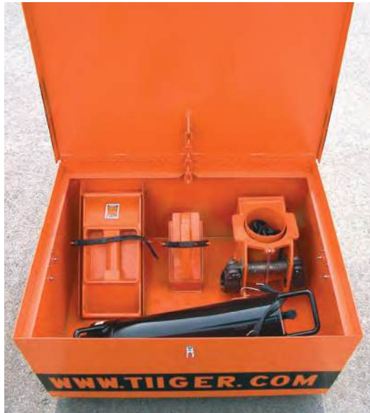
Deluxe Case With Forklift Clearance