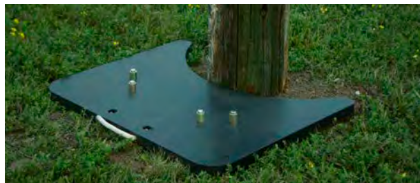
Pole Puller Pad provides greater surface area to resist forces of the ram and prevents base plate from kicking back during operation. SOLD SEPARATELY