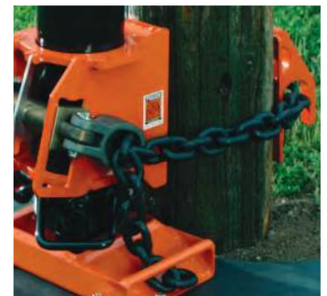
Swivel chain hook assembly is used to pre-tension chain to provide maximum lift per stroke.