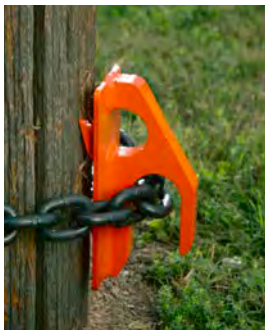
Back Plate prevents chain roll-up and slippage.