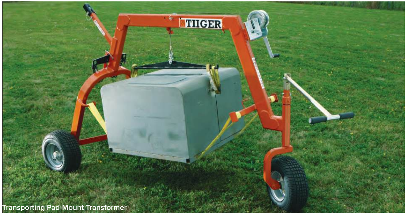
Transporting Pad-Mount Transformer