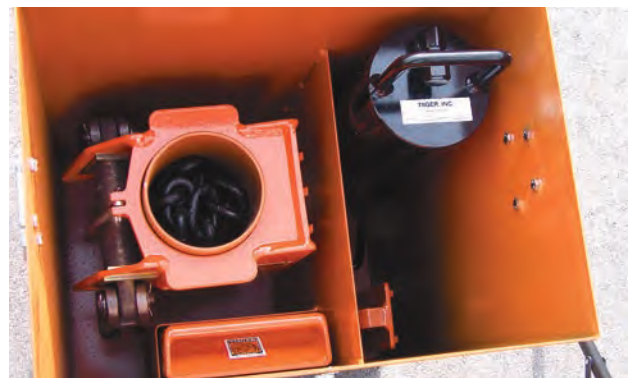
Wheeled Case With Pull Handle