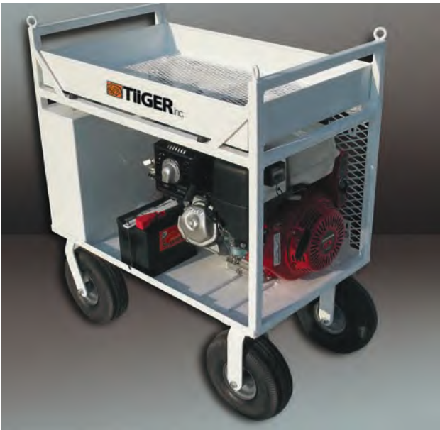
Cube II and III