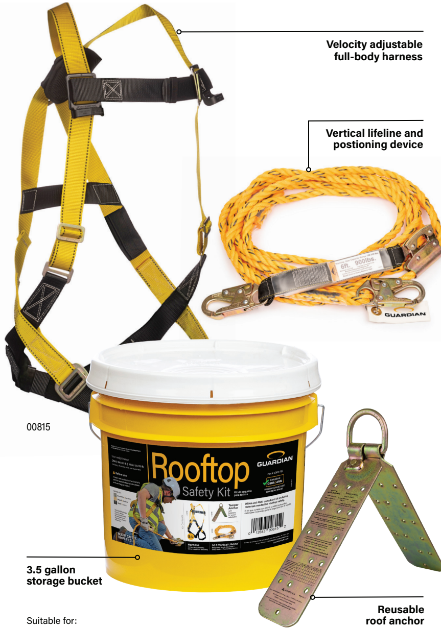
Velocity adjustable full-body harness