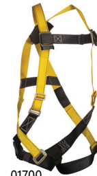
01700 Velocity Full-Body Harness