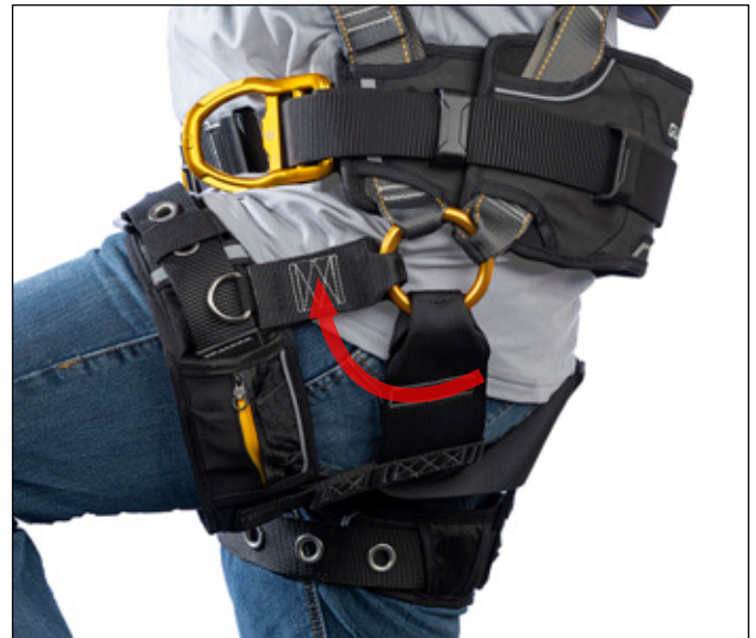
Full range of unrestricted movement

Some images are representative only to show function.