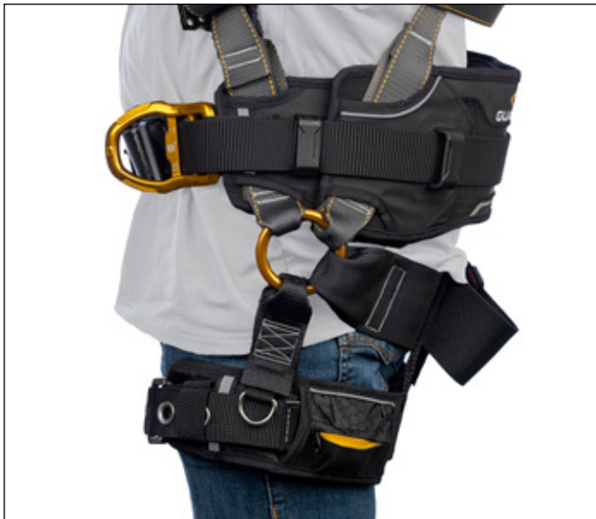
Unique O-Ring chassis design

The B7-Comfort's unique Three-Six-O harness chassis design keeps the harness fully integrated while allowing the torso and sub-pelvic and legs to move independent of each other. This lends to a full range of unrestricted movement of the hip joint for unrivaled mobility around the job site.