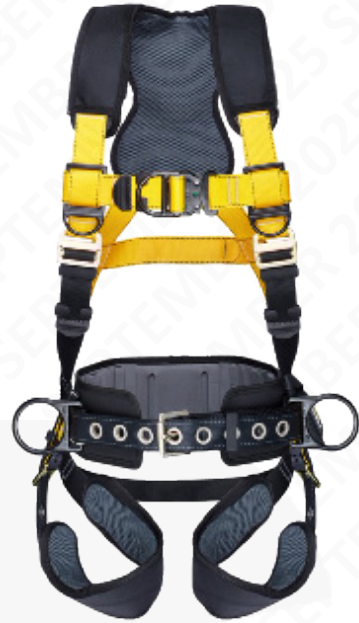
Pictured: 37380 Represents 37381 - 37383, 373801, 373811, 373821, 373831