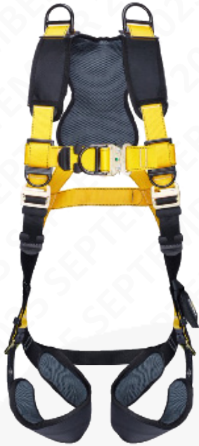
Pictured: 37328 Represents 37329 - 37331