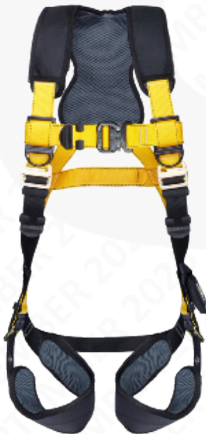
Pictured: 37304 Represents 37305 - 37307, 373041, 373042, 373051, 373052, 373061, 373062, 373071