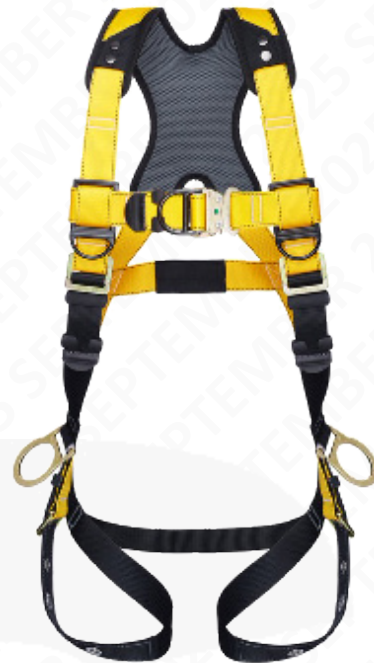
Pictured: 37132 Represents 37133 - 37135