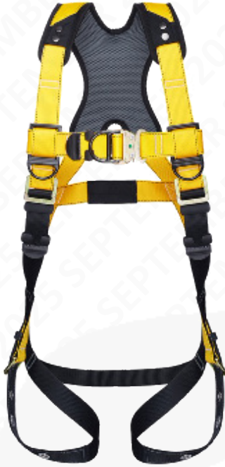
Pictured: 37128 Represents 37129 - 37131