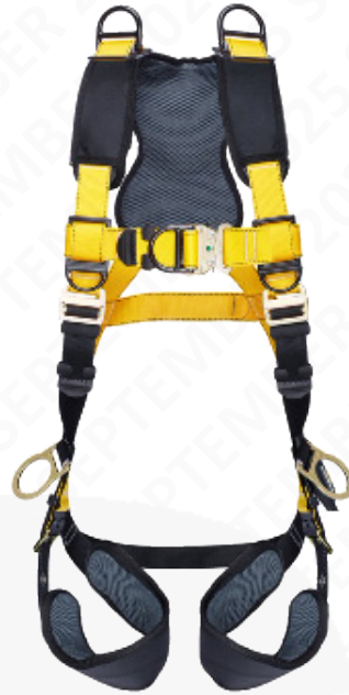
Pictured: 37364 Represents 37365 - 37367 373651, 373661, 373671