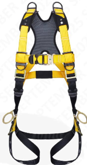
Pictured: 37196 Represents 37197 - 37199 371961, 371971, 371981, 371991