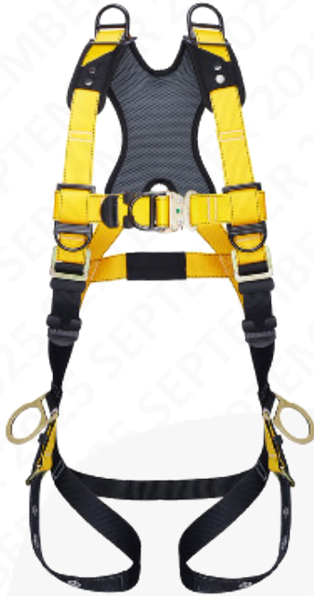
Pictured: 37144 Represents 37145 - 37147