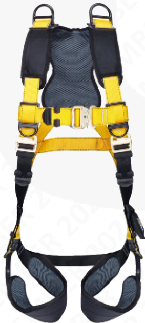
Pictured: 37320 Represents 37321 - 37323