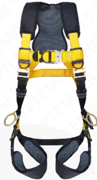
Pictured: 37316 Represents 37317 - 37319