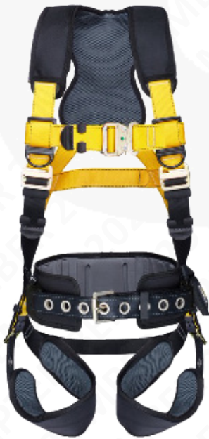
Pictured: 37368 Represents 37369 - 37371, 373681 - 373687, 373691, 3736910, 3736911, 373692 - 373699, 373701 - 373707, 373711 - 373715