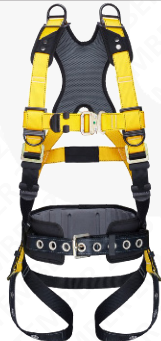
Pictured: 37216 Represents 37217 - 37219, 372171