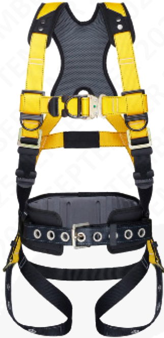
Pictured: 37208 Represents 37209 - 37211, 372111