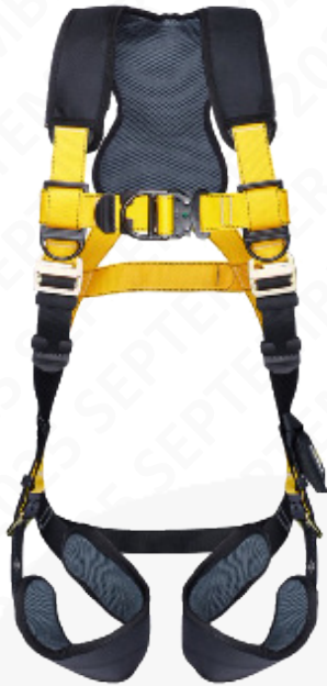
Pictured: 37312 Represents 37313 - 37315