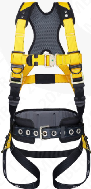
Pictured: 37200 Represents 37201 - 37203, 372001 - 372008, 372011 - 372019, 372021 - 372028, 372031 - 372037, 3720111 - 3720112