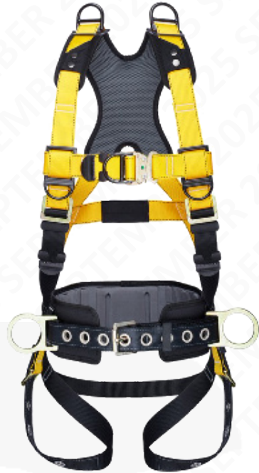
Pictured: 37300 Represents 37301 - 37303, 373001 - 373005 373011 - 373016, 373021 - 373025, 373031 - 373035