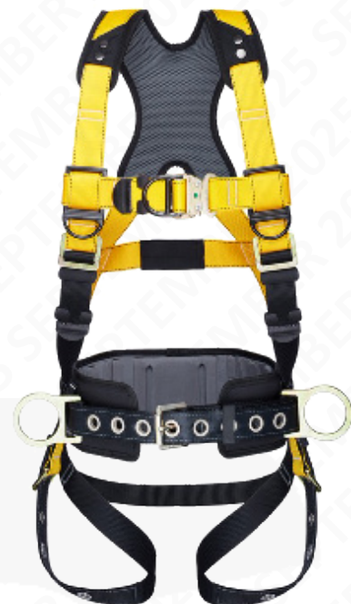
Pictured: 37212 Represents 37213 - 37215