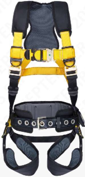
Pictured: 37376 Represents 37377 - 37379