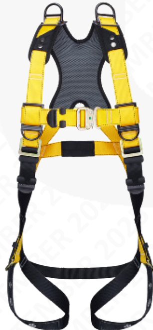
Pictured: 37136 Represents 37137 - 37139