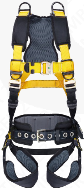
Pictured: 37384 Represents 37385 - 37387