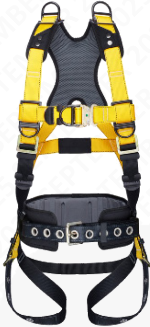
Pictured: 37224 Represents 37225 - 37227