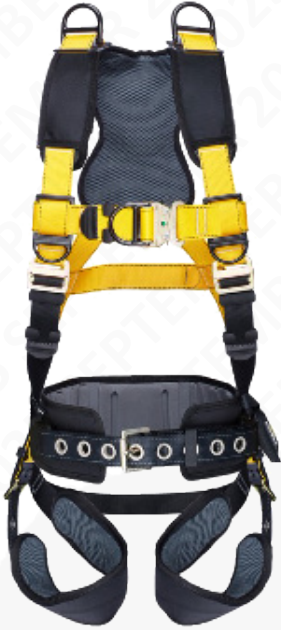
Pictured: 37392 Represents 37393 - 37395