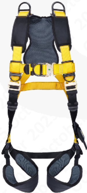
Pictured: 37360 Represents 37360 - 37363