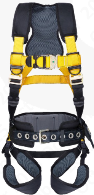
Pictured: 37408 Represents 37408 - 37411