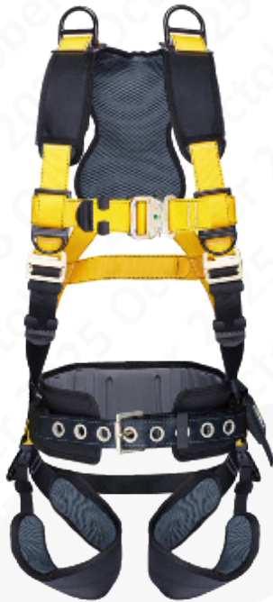
Pictured: 37416 Represents 37416 - 37419