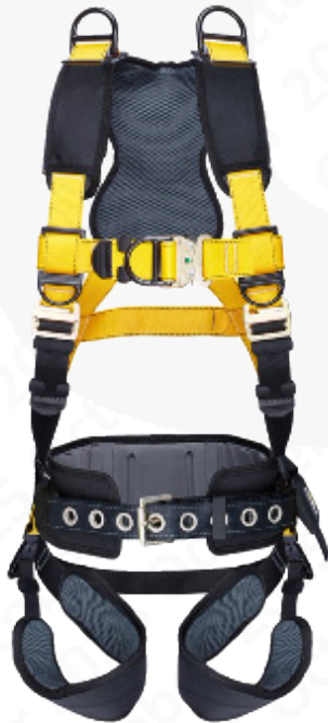
Pictured: 37424 Represents 37424 - 37427