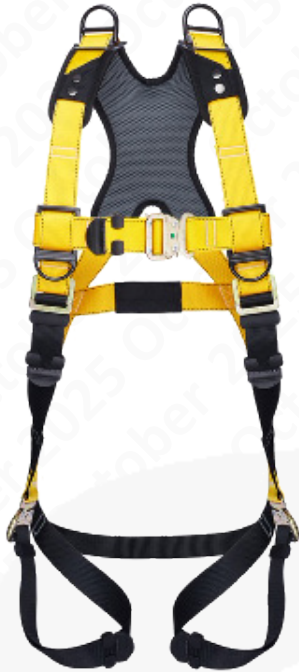
Pictured: 37168 Represents 37168 - 37171