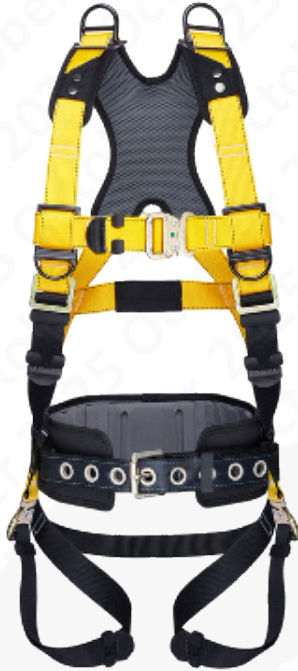
Pictured: 37248 Represents 37248 - 37251