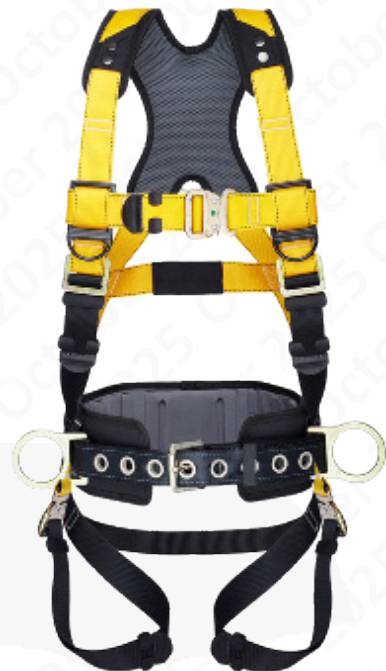
Pictured: 37236 Represents 37236 - 37239