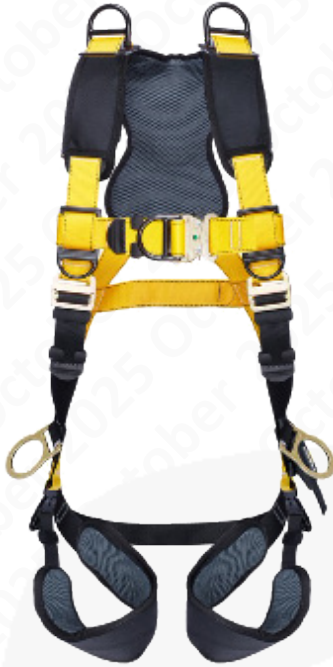
Pictured: 37400 Represents 37400 - 37403, 374021