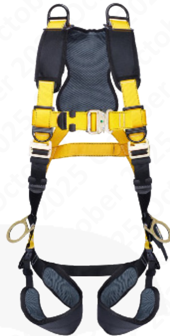
Pictured: 37356 Represents 37356 - 37359