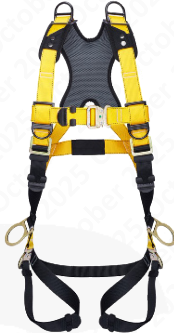
Pictured: 37172 Represents 37172 - 37175