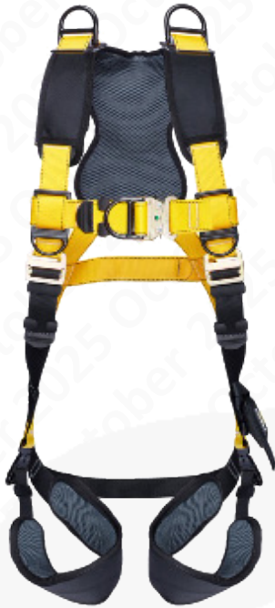
Pictured: 37352 Represents 37352 - 37355