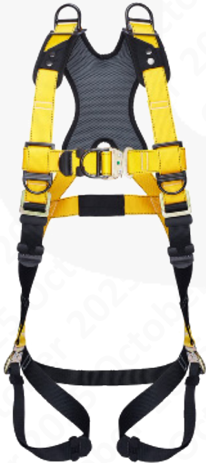
Pictured: 37176 Represents 37176 - 37179