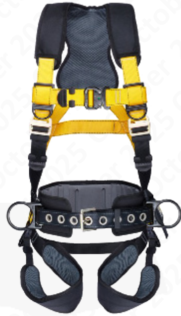
Pictured: 37404 Represents 37404 - 37407