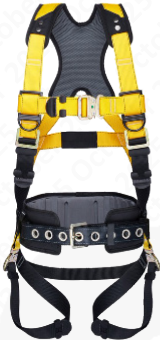
Pictured: 37232 Represents 37232 - 37235