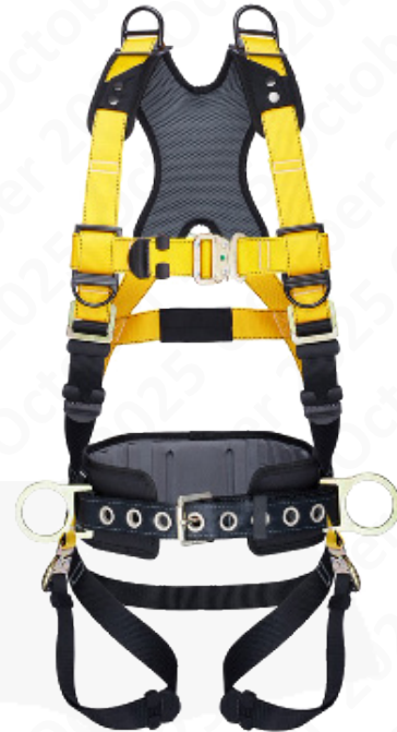
Pictured: 37252 Represents 37252 - 37255