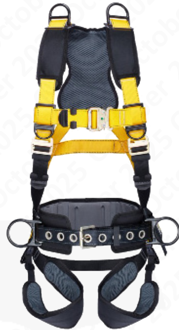
Pictured: 37420 Represents 37420 - 37423