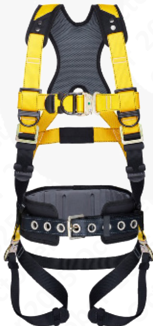
Pictured: 37240 Represents 37240 - 37243