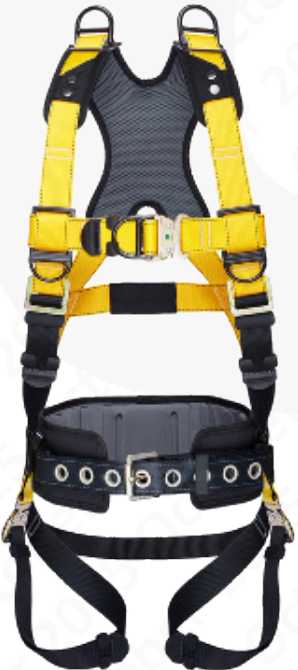
Pictured: 37256 Represents 37256 - 37259