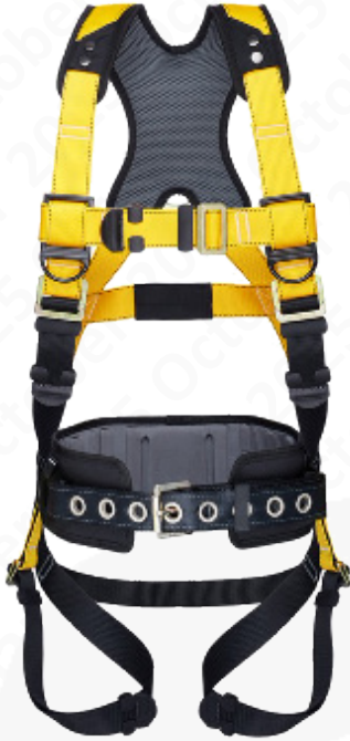
Pictured: 37188 Represents 37188-37191