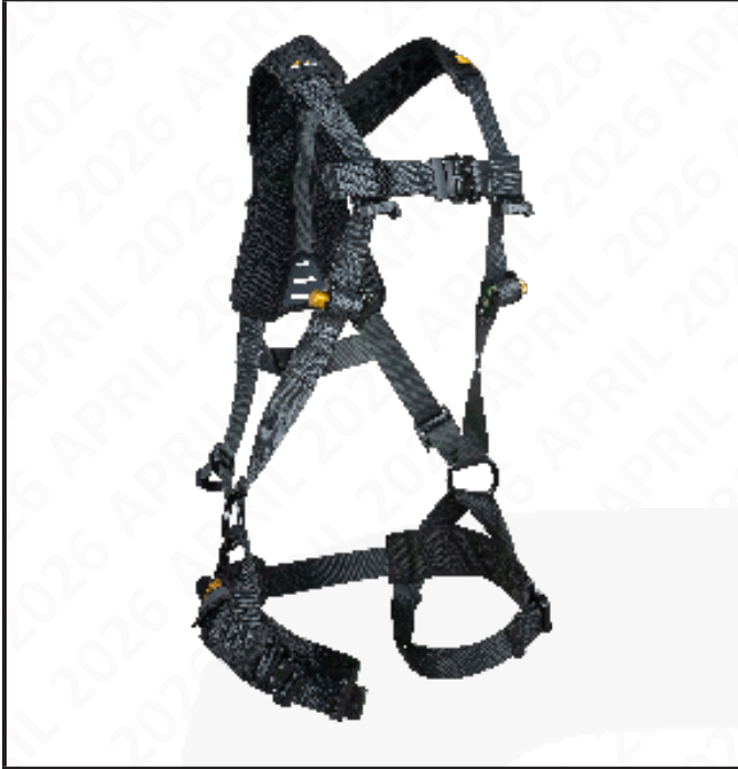
Pictured: 3737369 Represents 3737368 - 3737371