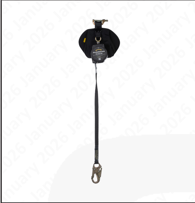
Pictured: 4200250 Represents 4200250