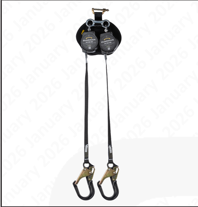
Pictured: 4200258 Represents 4200258