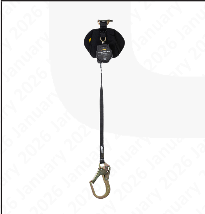
Pictured: 4200252 Represents 4200252