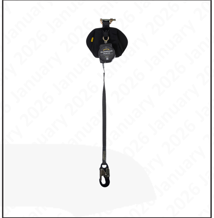
Pictured: 4200251 Represents 4200251