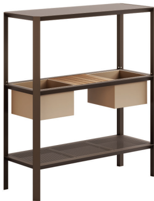
#E2050A Layout H55"xW47"xD18" 53 Lbs.

Design by Andreucci & Hoisl | Aluminum, Steel & FSC® Teak