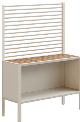
#E2050B Layout H66.5"xW47"xD18" 73.5 Lbs.