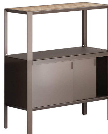
#E2050C Layout H55"xW47"xD18" 95 Lbs.