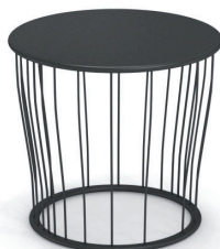
#E1088 Side Table