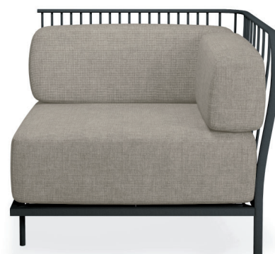
#E1082 Lounge Right Module