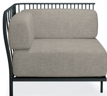
#E1083 Lounge Left Module