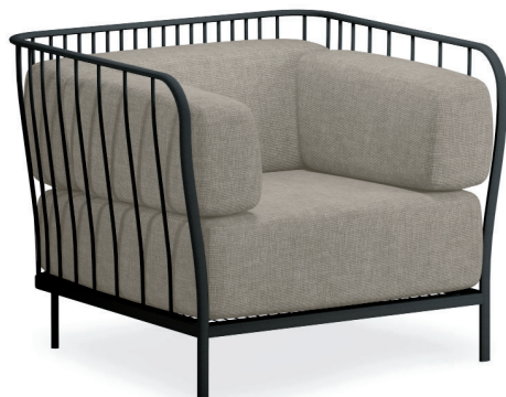
#E1080 Lounge Armchair

Design by Cristell / Gargano | E-Coated Steel Frame