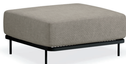
#E1085 Lounge Ottoman