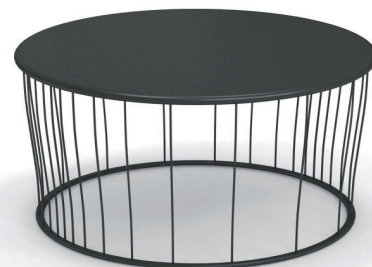
#E1087 Low Table