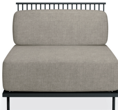
#E1081 Lounge Center Module