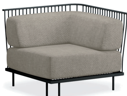
#E1084 Lounge Corner Module