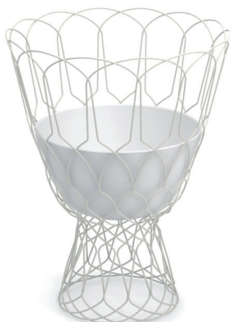
#E577 Tall Vase H41.5"xW28.5"xD28.5" 20.5 Lbs.