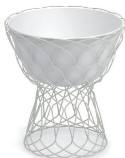
#E578 Short Vase H28"xW25.5"xD25.5" 49.5 Lbs.