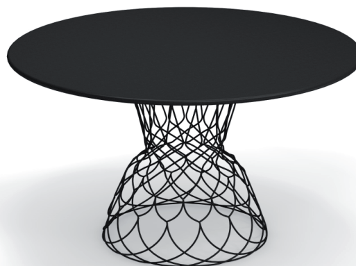
#E570 Dining Table H29"xW51"xD51" 64 Lbs.