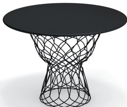
#E569 Dining Table H29"xW41.5"xD41.5" 49 Lbs.