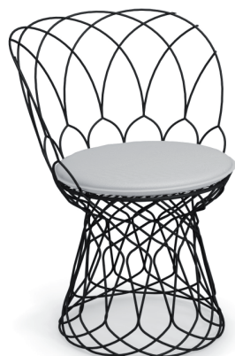
#E565 Side Chair H30.5"xW26"xD23.5" 16 Lbs.

Design by Patricia Urquiola | E-Coated Steel Frame