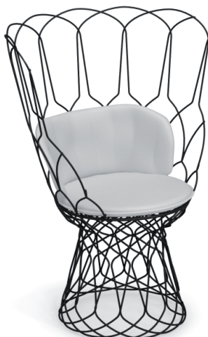
#E566 Armchair H41.5"xW30"xD24" 21 Lbs.