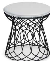
#E575 Pouf H17.5"xW17.5"xD17.5" 12 Lbs.