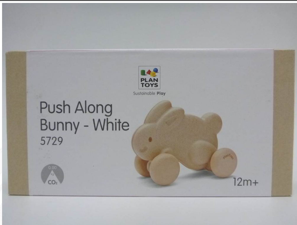
5729 PUSH ALONG BUNNY – WHITE