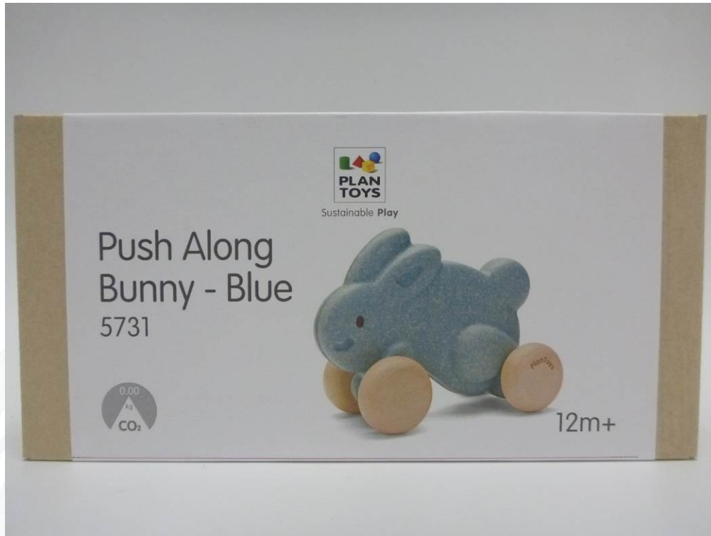
5731 PUSH ALONG BUNNY – BLUE