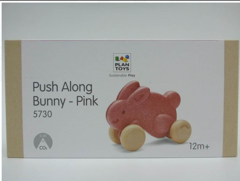
5730 PUSH ALONG BUNNY – PINK