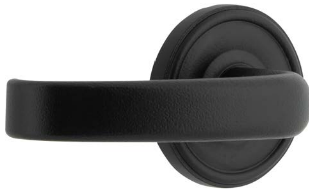
Crescent Lever on Loch Rosette