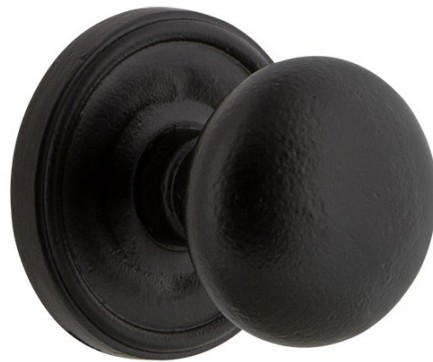
Keep Knob on Loch Rosette

> Material: Cast iron, zinc plated and powder coated