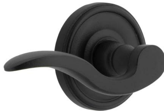
Palisade Lever on Loch Rosette