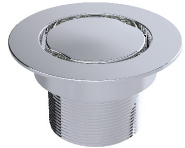
BCS.102.11 SHOWN (CHROME PLATED)

ASME A112.18.2/CSA-B125.2 The "cCSAus" Meets UPC & IPC Code" mark means the product conforms to the requirements of the NPC, UPC, IPC, and IRC.