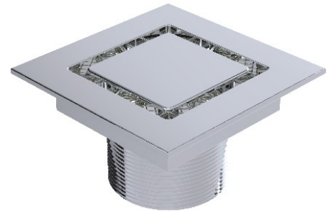
BCS.202.11 SHOWN (CHROME PLATED)

ASME A112.18.2/CSA-B125.2 The "cCSAus" Meets UPC & IPC Code" mark means the product conforms to the requirements of the NPC, UPC, IPC, and IRC.