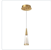
402401BG-LED Brushed Gold