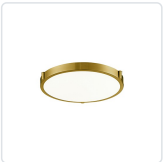
501102BG-LED Brushed Gold