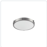
501102-LED Brushed Nickel